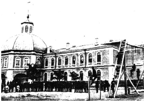
Gevorkian Chemaran (Academy)

were developed in the country – elementary single-form, two-form schools and state secondary schools where the teaching was conducted in Russian. State Secondary schools were financed by the Tsarist government and by the parents of the pupils. As far as Single-form, two-form schools and spiritual ones are concerned, the subjects were taught in Armenian and the schools were supported by the means of the population, various charities and partly by the church.