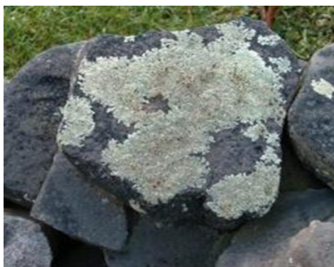
Fig. 1. X. stenophylla lichen on the rock at the sampling site.

Collection of lichen samples. Samples of X. stenophylla crustose saxicolous lichen were collected from Gegharkunik Province of Armenia, near Norashen village (40°52'06.9"N 45°27'09.8"E, altitude 1928 m AMSL) (Fig. 1). Sampling was held from September to October 2018. The sampling site was chosen considering the high humidity and high altitude of area, which promoted rapid growth of lichens. The herbarium of lichen thalli is currently maintained at the Department of Biochemistry, Microbiology and Biotechnology of YSU.