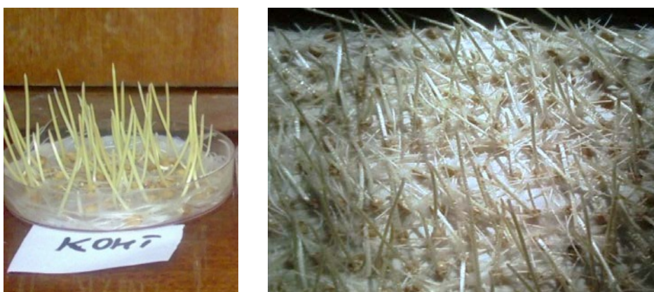
Fig. 1. Photo of seedlings of seeds of control and treated with \gamma -irradiation at doses of 50 Gy.

applications, especially for the production of new varieties and breeds in agriculture. Investigation of the effect of IR on wheat seeds with hybrid depression, firstly, revealed that seeds germinate in dark conditions in an unnatural way for control seeds, and the ability to lodge was manifested. This indicates the occurrence of mutations in the genes Rht-B1b, Rht-D1b, Rht8, Rht11 lodging resistance in seeds of common wheat [12]. As you know, wheat lodging is one of the main problems of reducing the yield and grain quality of winter and spring wheat. Fig. 1 shows 4-day-old seedlings of control seeds and seeds irradiated with ionizing radiation, where lodging of seedlings and a change in their color are seen.