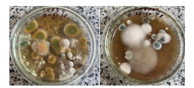
Fig. 2. Petri dishes with micromycetes colonies.

We isolated test cultures from 6 species of microscopic fungi, which are known as key biodestructors, from the soil micromycetes: Aspergillus niger , Alternaria alternata , Rhizopus stolonifer , Cladosporium herbarum , Fusarium sporotrichioides , Penicillium canescens . After that, the water-spore suspensions from the pure cultures were made and the Petri dishes were artificially infected (Fig. 2).