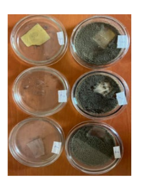
Fig. 8. 60th day of test.