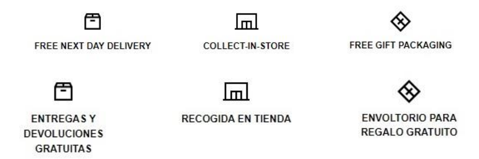
Fig. 1. Menus with hypertexts in the Burberry newsletters.

As for the links, they are usually implemented in the message body and may be represented in different forms, such as hypertexts (hidden links that allow the user to open another page) or buttons. The first ones may appear as a menu in the upper and lower parts of the message: